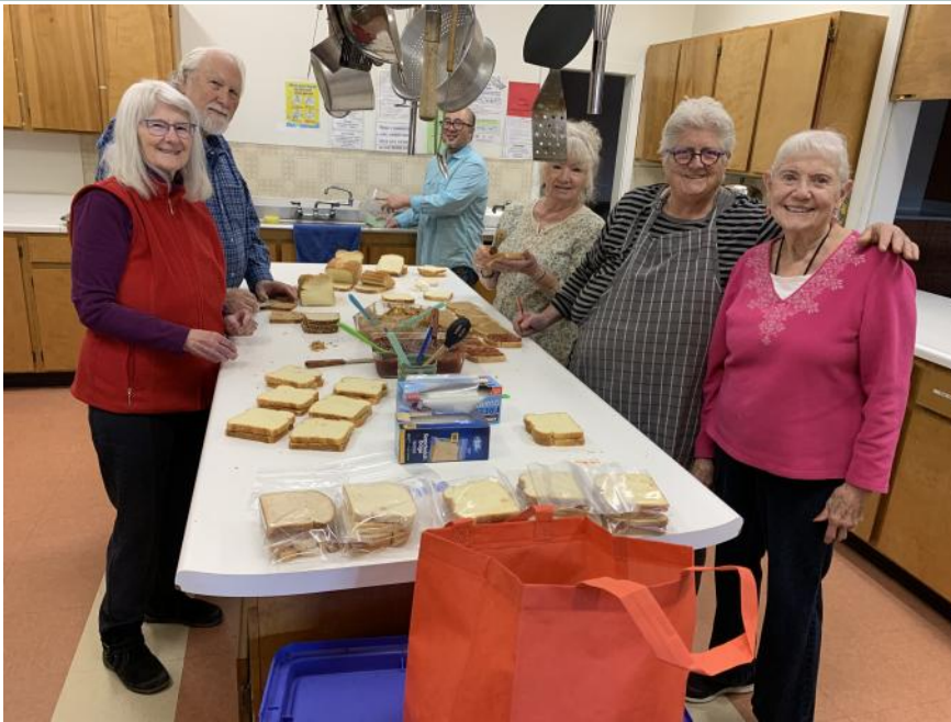
Making sandwiches for those in need. It was a joint UCC/UU operation!