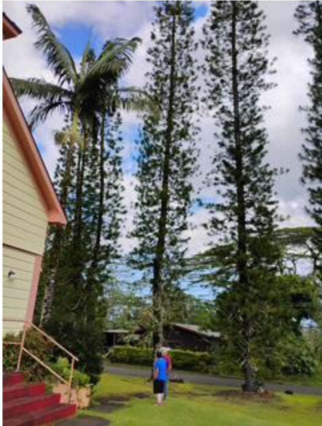
The trees and foliage are so dramatic over there! This is the corner of the church building, and people visiting after worship.

Now comes the important part—everyone needs to go to Hawai'i so they can thank you in person!