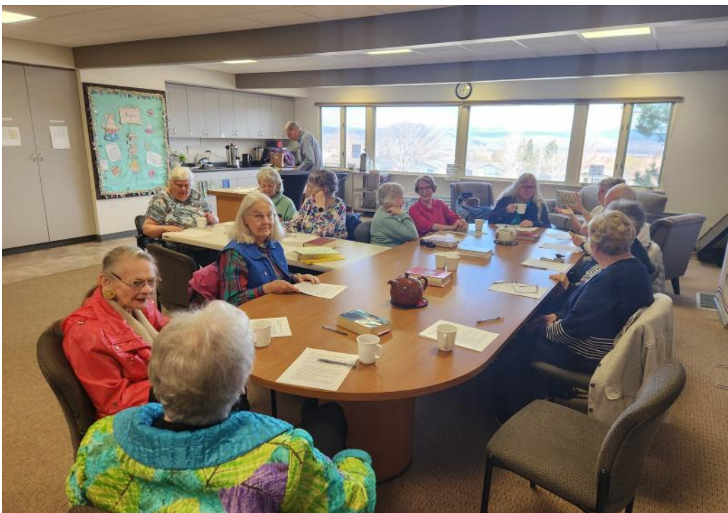
Bible study, Tuesday, April 14.