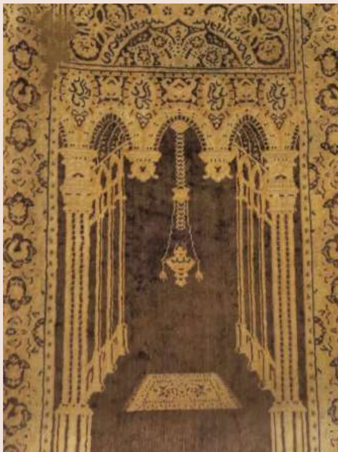
Muslim Prayer Rug (right)