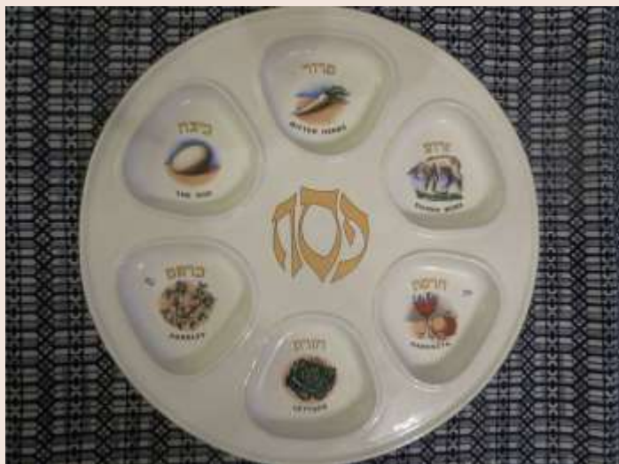
Passover Seder Plate