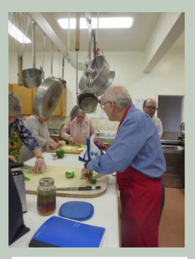
Kitchen crew hard at work preparing dinner for God's Love

All of us from Plymouth Congregational Church wish you, your friends and family a beautiful and blessed Thanksgiving!