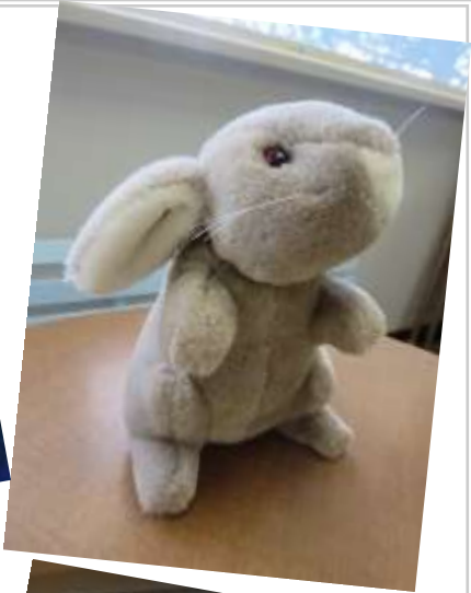
Lenten Reminders in the Sanctuary