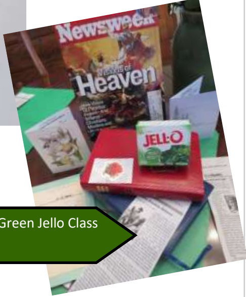
Green Jello Class